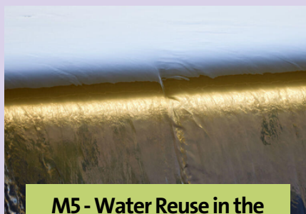
M5 - Water Reuse in the Industry