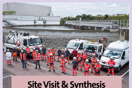
Site Visit & Synthesis Workshop