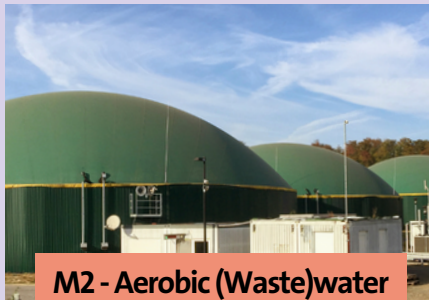
M2 - Aerobic (Waste)water Treatment