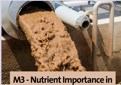
M3 - Nutrient Importance in Wastewater Treatment