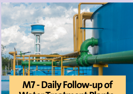
M7 - Daily Follow-up of Water Treatment Plants: Tips & Tricks