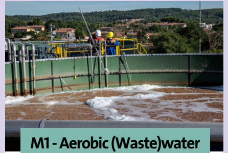
M1 - Aerobic (Waste)water Treatment